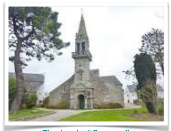
The church of Gouesnac'h