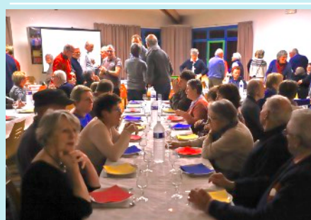
The annual dinner of the association

Among them are individuals, schools, parishes, and even other